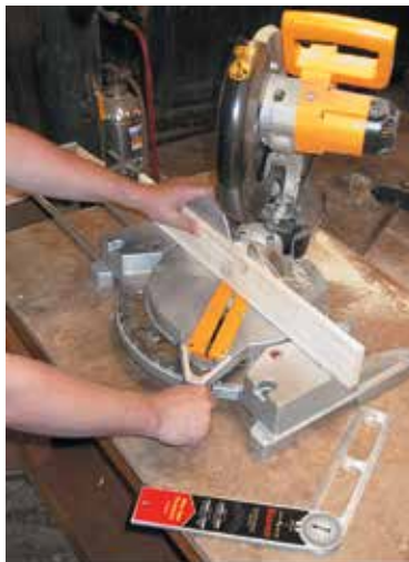
2. Set the saw to the angle that the black arrow points to on the black number scale