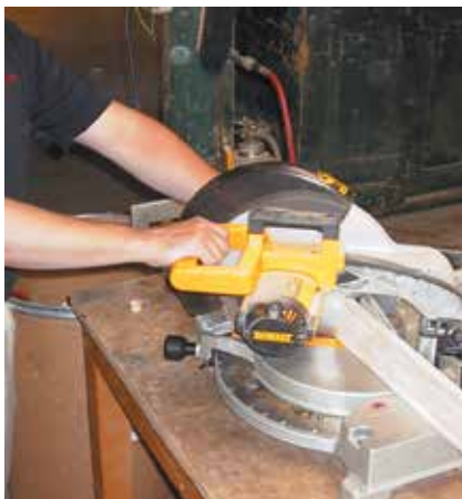
3. Cut the pieces with the left and right angle, respectively