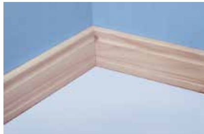
4. The result: A perfect miter