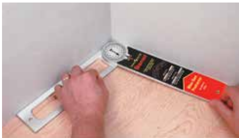
1. Measure the angle

The ProSite® Protractor saves the time and reduces waste. It's ideal for carpenters, plumbers and all building trades as well as invaluable for home use.