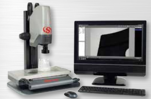
KMR-200 with M3

The KMR-200 utilizes a 6.5:1 zoom lens, digital video camera and a precision 4 x 8" (200 x 100mm) X-Y stage with digital encoders that interface with the system PC and the M3 software to provide accurate repeatable measurements. System features also include a 24" touch screen and PC (8GB RAM, 128 GB SSD, Windows® 10 Professional, 64 Bit), and MetLogix M3 vision metrology software. These simple yet high-performance metrology systems are ideal for high accuracy, high throughput measurements of small parts, with automatic comparison to CAD files and electronic record keeping.